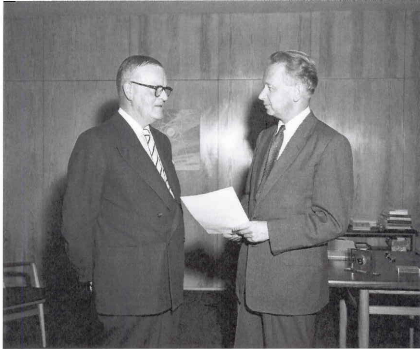
Ambassador Frederick Boland presents his credentials to United Nations Secretary-General Dag Hammarskjöld on 15 th October 1956